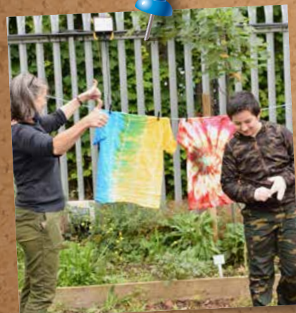
Tie dye workshop at Summer Sessions