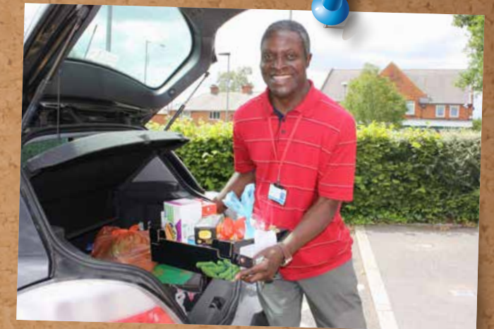
Just one of the scores of Hub volunteers who delivered food parcels in lockdown.