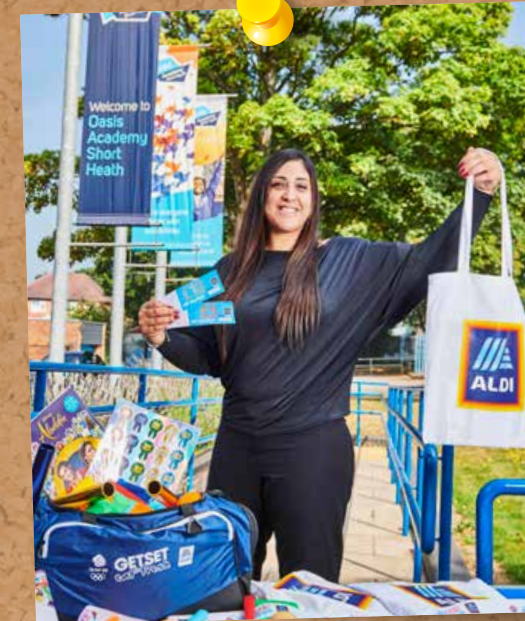
Aldi were one of the many supermarkets who generously supported our food programmes with free produce over the Summer