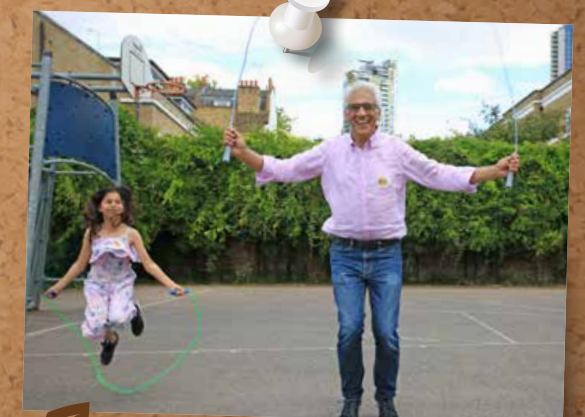
Steve Chalke being outskipped by a school pupil at a Summer Sessions sports activity in London.