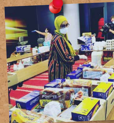
Park Plaza Hotel lent us a huge kitchen and storage area in London where we cooked over 20,000 meals for delivery