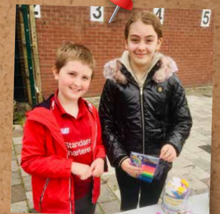
Children signing in to Covid-compliant Summer Sessions in Oldham