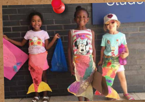
Little Mermaids show what they made in a craft workshop at a Summer School Session in Oasis Hub Ashburton Park

Thanks to your support, our Community Hubs were able to keep going and run Summer Session activities for young people in 22 locations, serve up 32,000 free lunches, run foodbanks and pantries and support families in need.